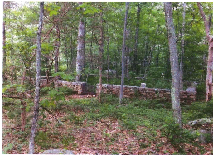
Photos of East Greenwich Historical Cemetery as well as the Samuel Tarbox headstone.