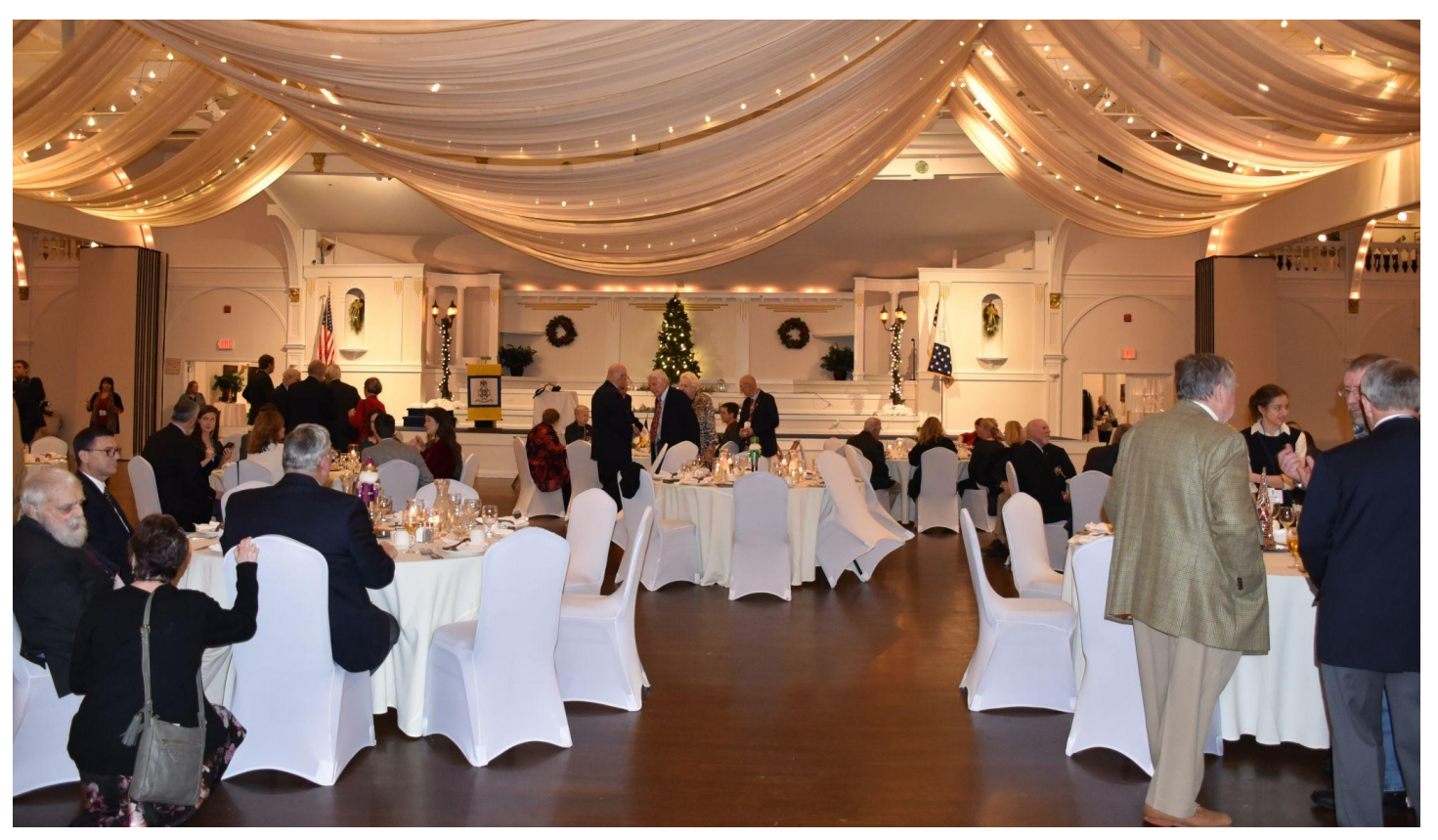
The Christmastime dinner of December 15th, 2021 took place at Rhodes on the Pawtuxet.