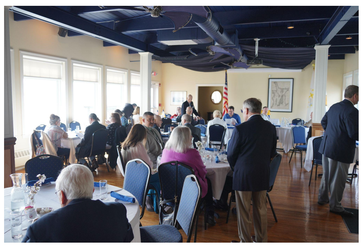
On April 9th, 2022, RISSAR compatriots and family gathered at the Rhode Island Yacht Club for the awards and social portion of the Annual Meeting. The business portion of the Annual Meeting had been conducted remotely two months prior.