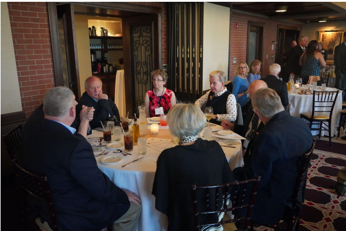
Compatriots and friends of the Society enjoy the chance to catch up as they await the food.