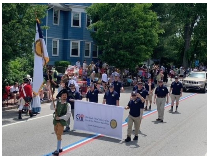
Members of RISSAR marching in the 2022 Gaspee Days Parade