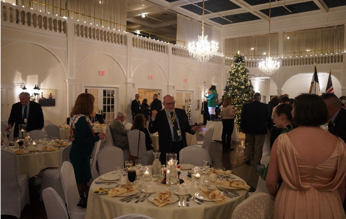
The annual Christmas / Holiday Dinner was held at Rhodes on the Pawtuxet on December 15th, with 80 total Compatriots and friends of the Society attending.