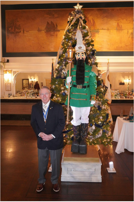
The December dinner featured a special guest appearance by The Nutcracker, who contributed to the festive atmosphere by posing for pictures with attendees and handing out candy.