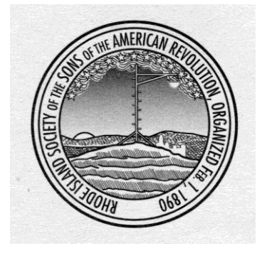
Organized February 1, 1890