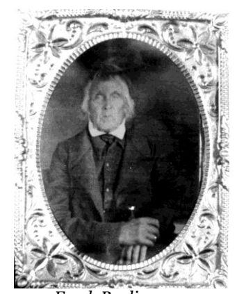
Eseck Burlingame Revolutionary War Veteran