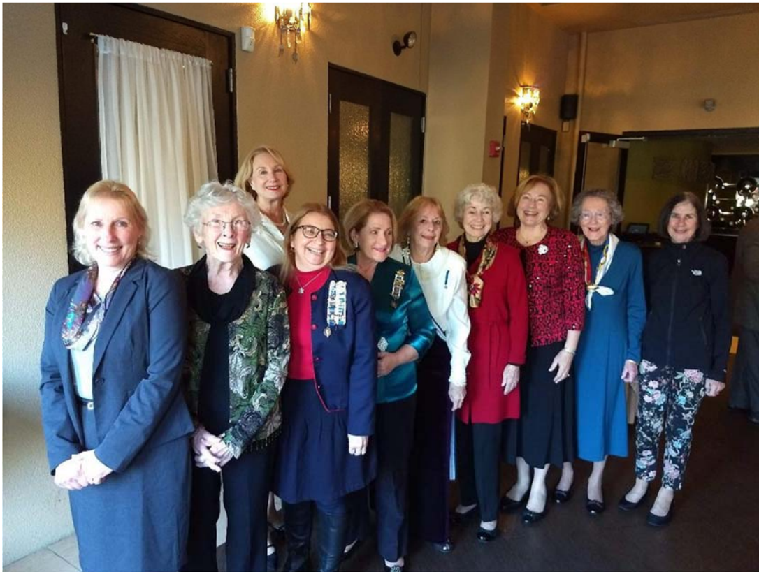
At the Annual Meeting in February at the 1149 Restaurant, a good number of DAR members posed for this group photo. The Annual Meeting is a good time for everyone and all are invited to attend.

Annual Meeting: The Annual meeting was another successful event. The business meeting included the election of the officers and board of managers and the presentation of donations to the Nathanael Greene Homestead and the Children of the American Revolution. Many awards were presented for member's efforts during the past year. After the meeting the traditional toast was offered followed by a luncheon.