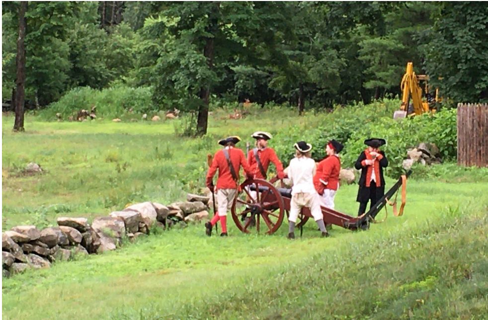
The Kingston Reds at the Greene Homestead - July 4th, 2021

We have hosted many small events this season, including drills and demonstrations from Living History groups and members of the RI Chartered Commands, our 4th of July Open House, and Gen. Greene's Birthday Open House, which was supported by the Kentish Guards. Most recently, on August 14 we hosted living historians representing a 1st Century Roman Legion and late 19th Century Anglo-Zulu British troops. On October 30th, we will be hosting a Halloween themed historical timeline.