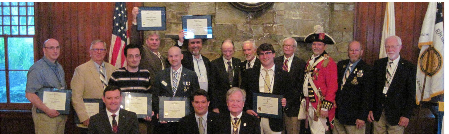
Moments after being sworn in, our newest members pose with their membership certificates.