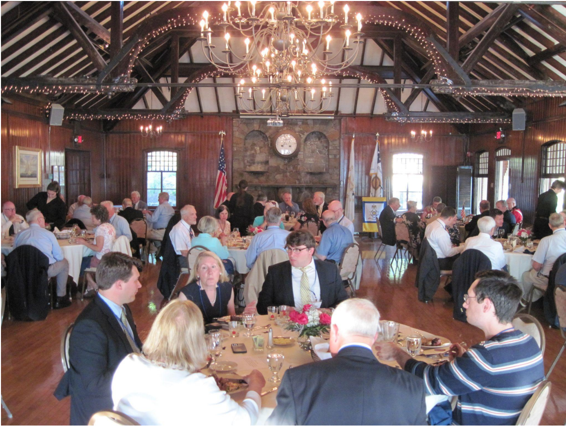
Great food and camaraderie were had by all.