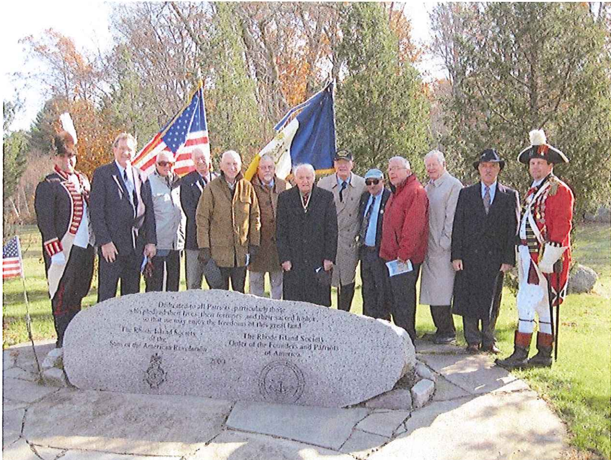
Veterans Day ceremony 2011